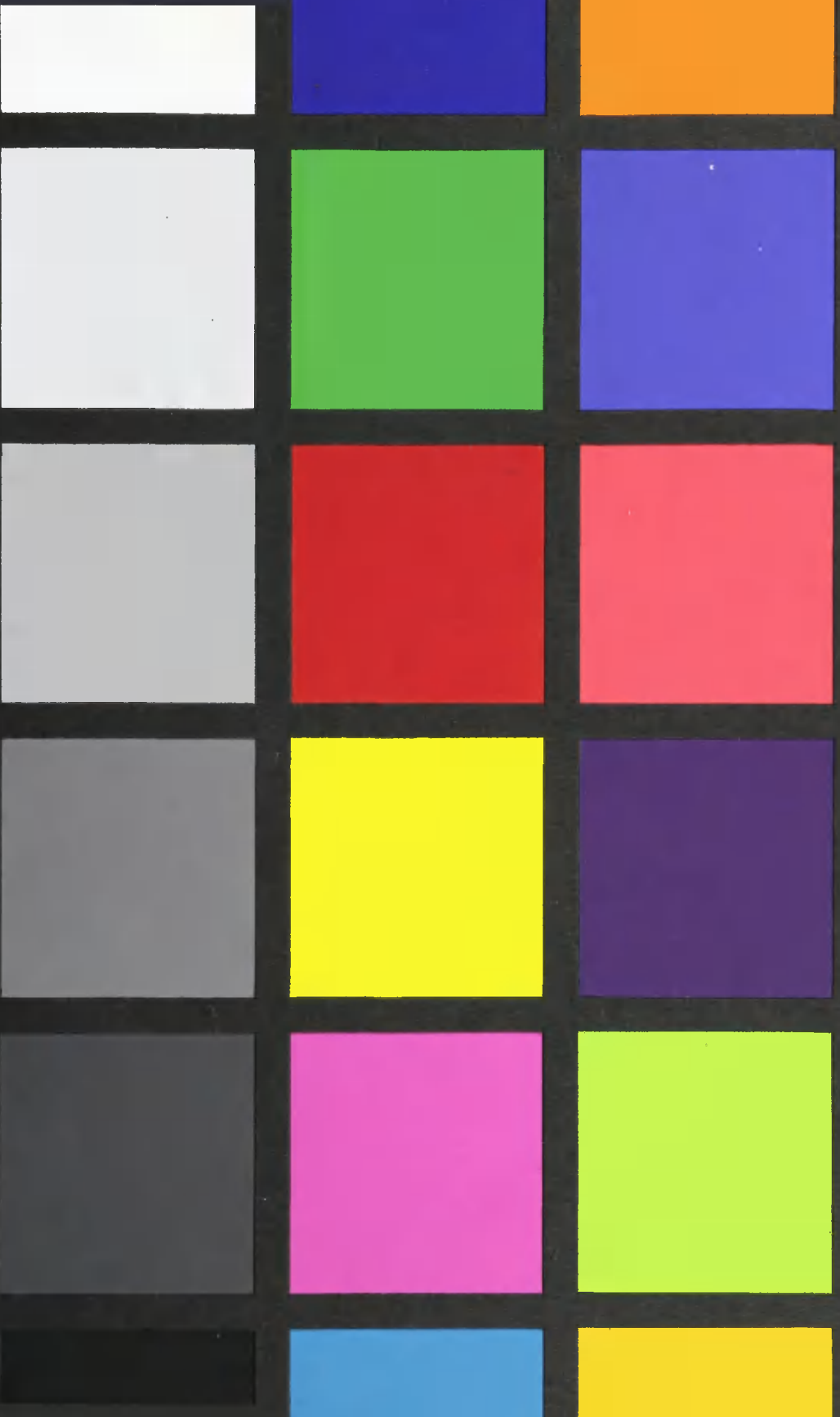
GretagMachbeth™ ColorChecker Color Rendition Chart